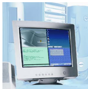
Real-time quad view

Be more productive, organized and efficient with the dynamic new QuadraVista Quad video KVM Switch from Rose Electronics.