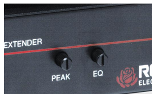
You can optimize the clarity of your video with the front panel controls

You'll think of many more applications for the CrystalView. Please call us today to discuss your application.