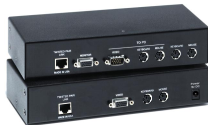
Rear view, of CrystalView dual local unit and remote unit