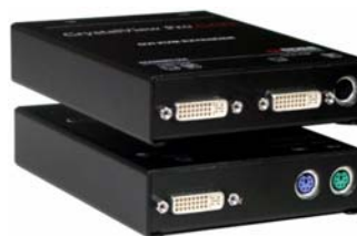
CrystalView DVI Fiber (Single video model)