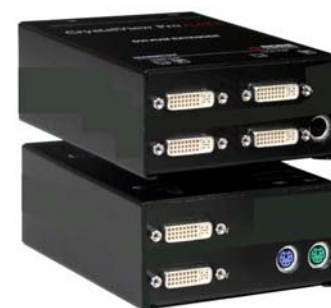
CrystalView DVI Fiber (Dual video model)