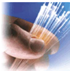
Fiber makes extended distances easy to reach

All models are available with both transmitter and receiver KVM access. The transmitter's KVM access allows an additional KVM station to be connected to the transmitter unit. If your system requires dual video, the CrystalView DVI Fiber dual video model can fully support it.