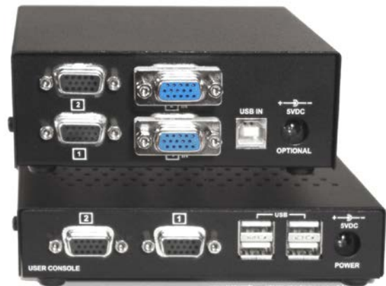
Rear view Local / Remote units Dual Video

■ Phone: 281-933-7673 ■ E-mail: sales@rose.com ■