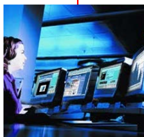
View single, or dual, video 1,000 feet away

The bi-directional serial option allows you to connect a touchscreen, digital tablet, serial printer or other supported serial device to the remote location. No set-up is needed; just connect the serial device to the serial port and it's ready to use.