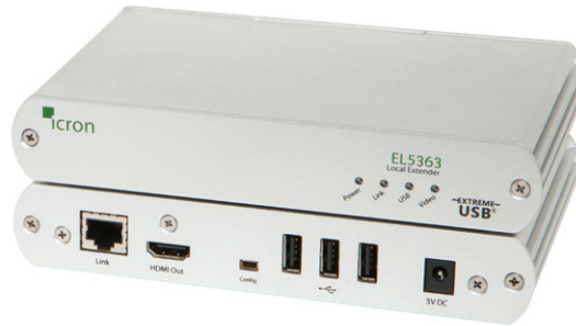
LEX (Local Extender) front view

The EL5363 KVM Extender System features the latest and most robust HD video and USB extension technology from Icron Technologies. The EL5363 extends both HDMI and USB 2.0 up to 100m using a single Cat 5e/6/7 cable.