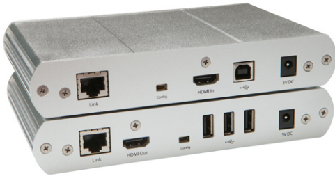
Rear view of LEX (top) and REX (bottom)