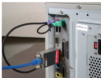
Connect the transmitter directly to a PC's Video, keyboard, and mouse ports